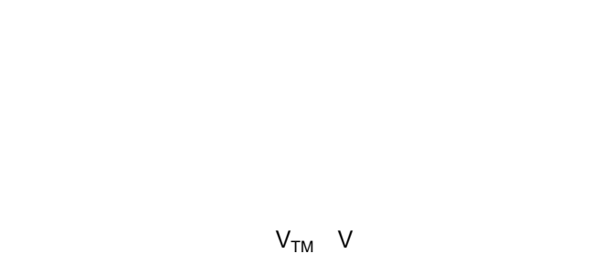
Figure 6. SCR Average On State Current vs Forward Voltage